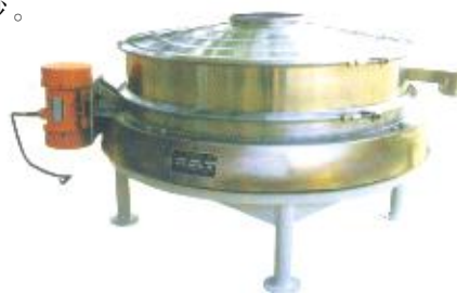
规格:SC-600 至 1800mm

多用于面粉、淀粉、洗衣粉、金属粉、添加剂、化工、非矿等行业的颗粒、粉末的粗略筛分、精密筛分,处理量大,易与生产线结合。您可在 600mm 至 1800mm 之间有更多的选择。